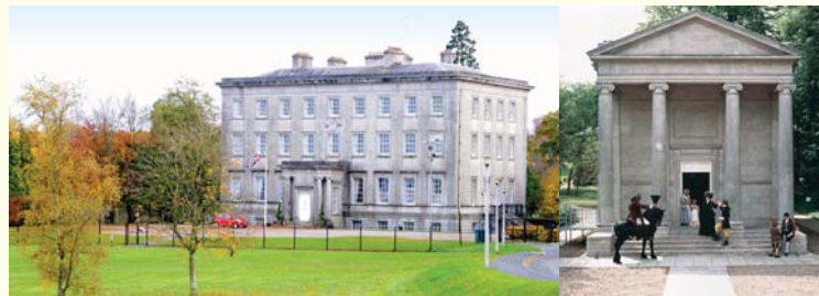
The Palace and Primate's Chapel