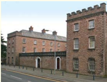
Armagh Royal School